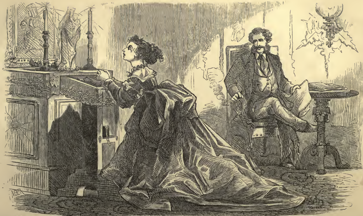
Hers was an accommodating piety, whose orisons would not be disturbed by smoke or light reading.