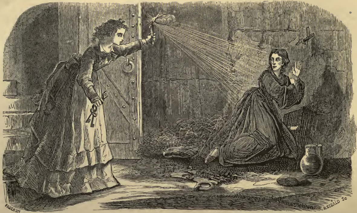
Then she opened the door, fearing greatly, and saw a young woman in a black dress crouched in one corner.—Page 125.