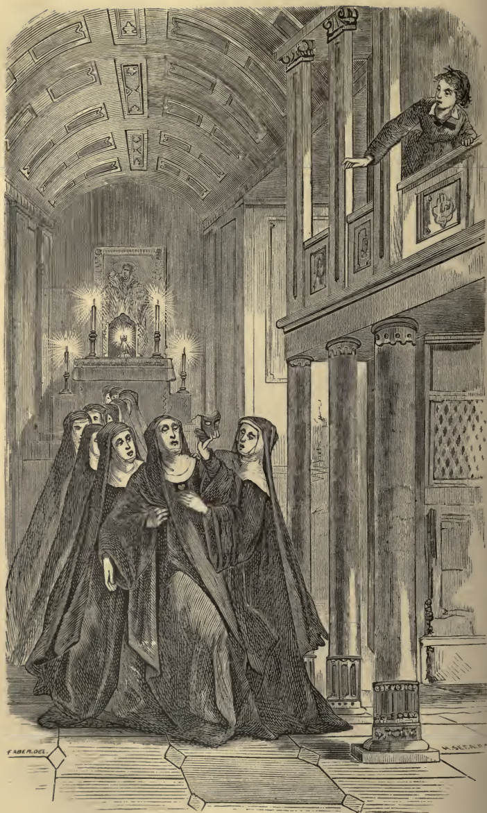
She bent over the railing of the gallery, crying, "Una Dunbar, Una Dunbar!"—Page 289.