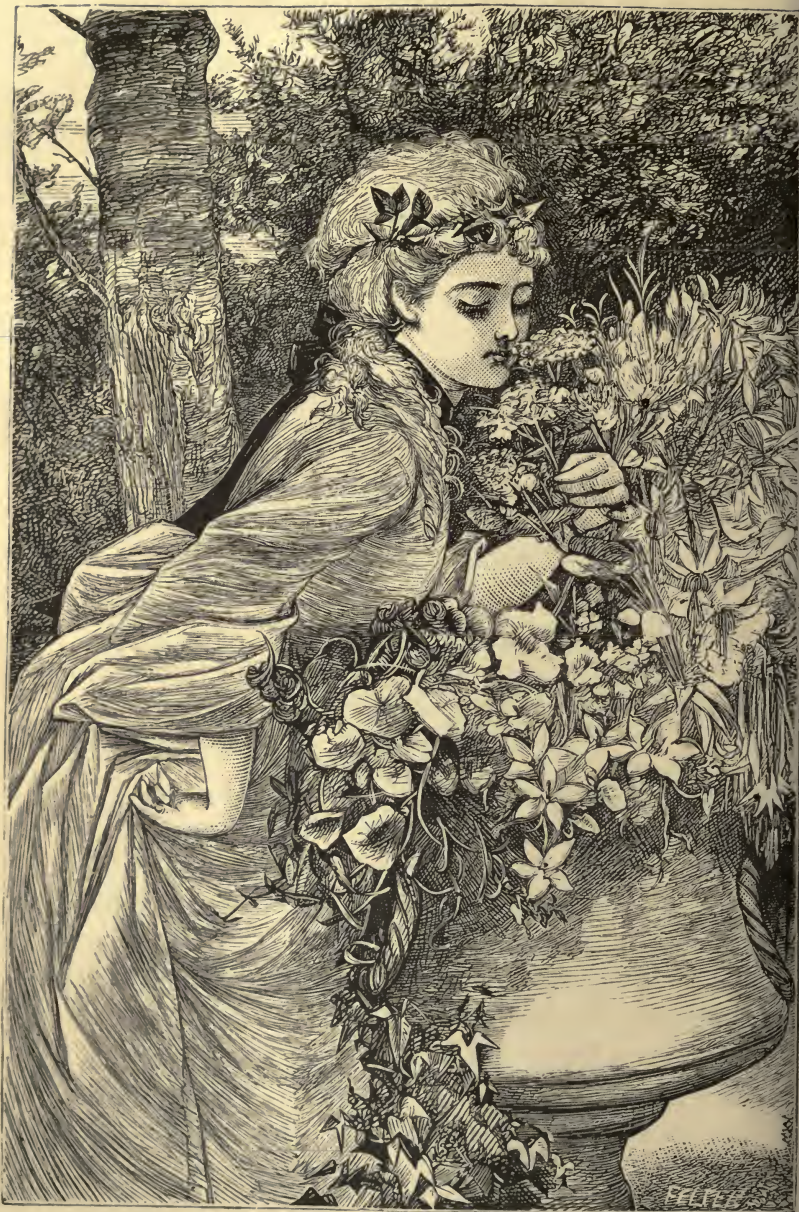
ALDA BURT IN THE GARDEN.