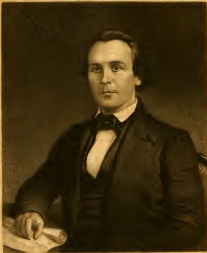
Engraved by SUTTON