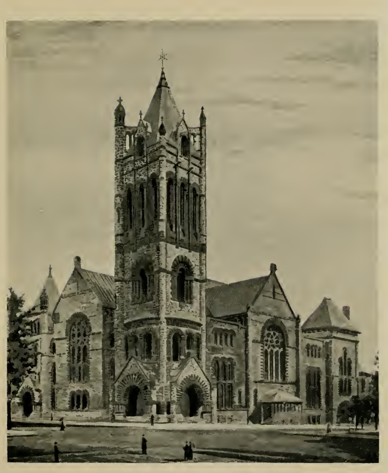
THE THIRD BROOKLYN TABERNACLE.