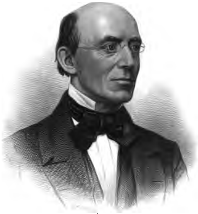
Wm. Lloyd Garrison.