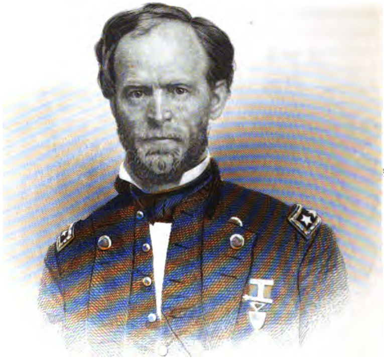
Fig. 100. A. H. F. 100.