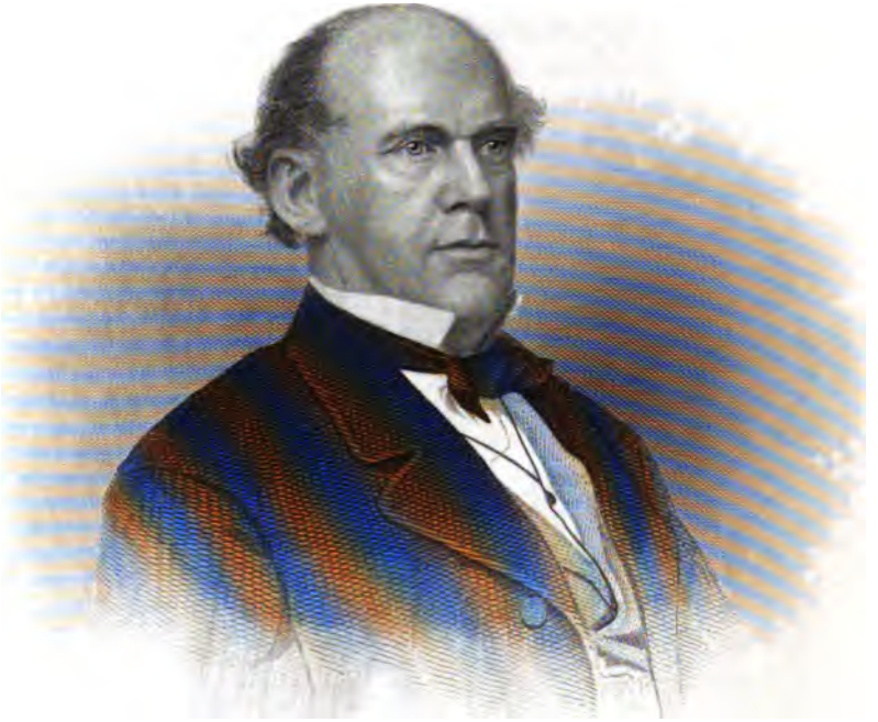
Fig. 4 by A. H. Ritchie