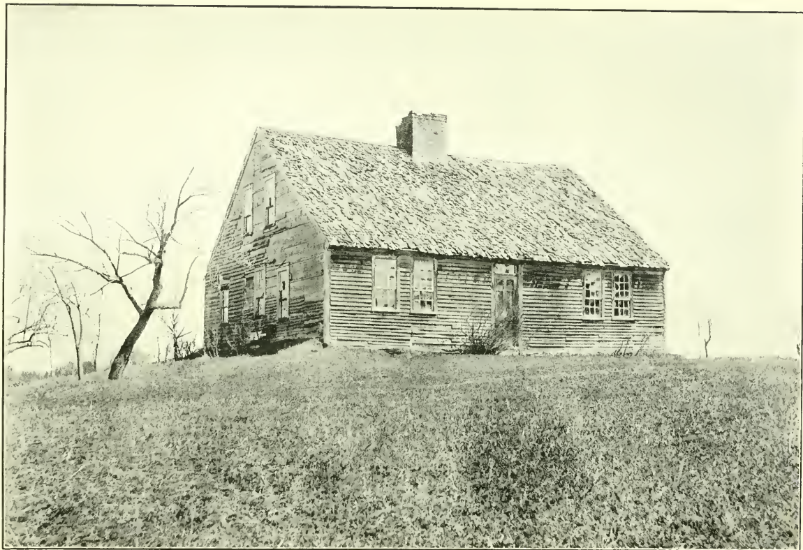
MATTHEW PATTEN HOUSE.