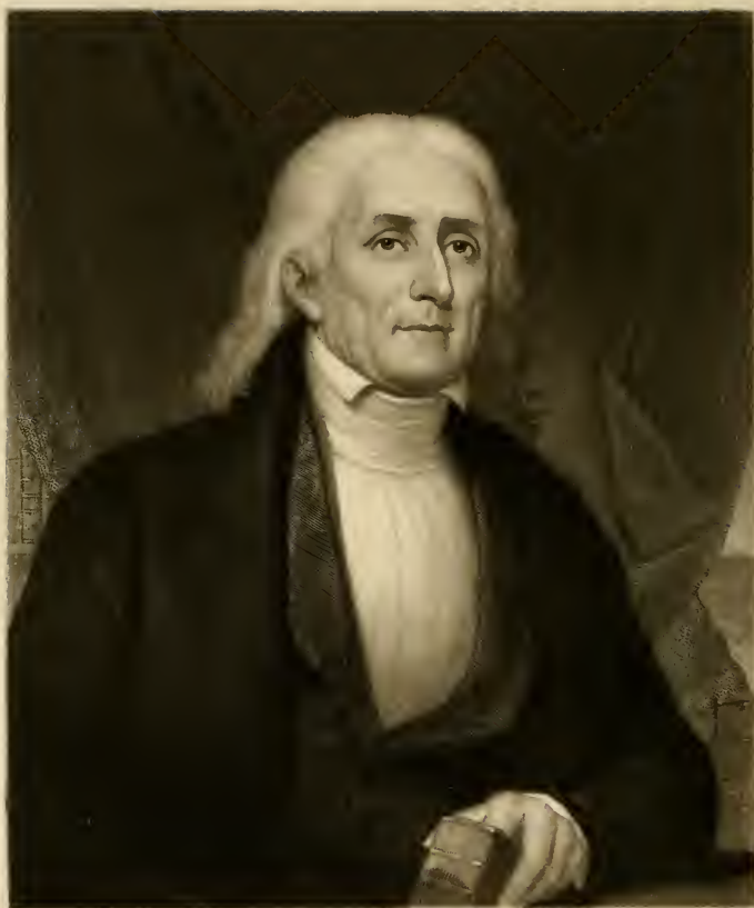
PAINTED BY R. STEELE