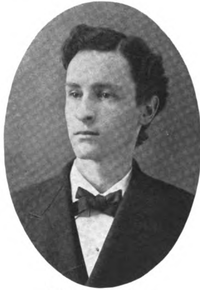
At Union Seminary About 1879