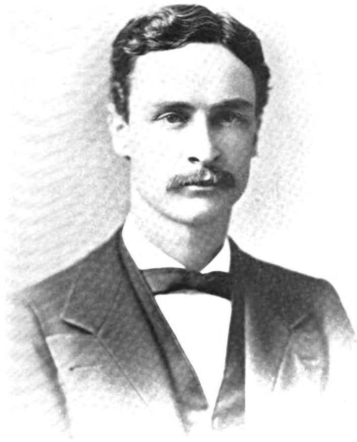
The Pastor at Millersburg at Twenty-five