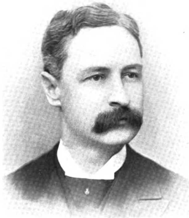
The Professor at Union Seminary at Thirty-five