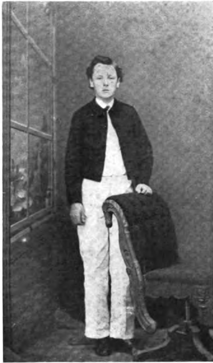
The Lad of Fifteen at Finley High