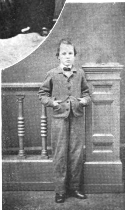
The Boy of Ten

Generated at Library of Congress on 2021-11-12 01:59 GMT / https://hdl.handle.net/2027/mdp.39015075072705 Public Domain, Google-digitized / http://www.hathitrust.org/access_use#pd-goo