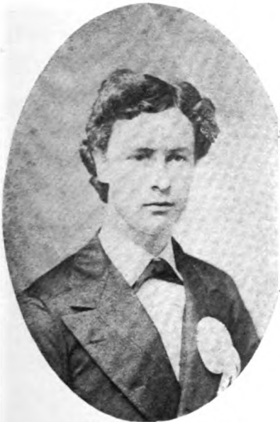
At Davidson College 1877