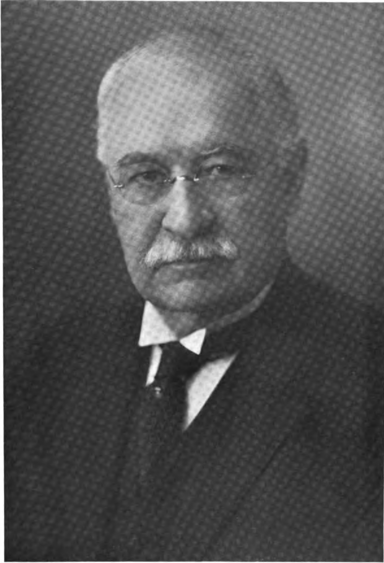
In His Late Sixties