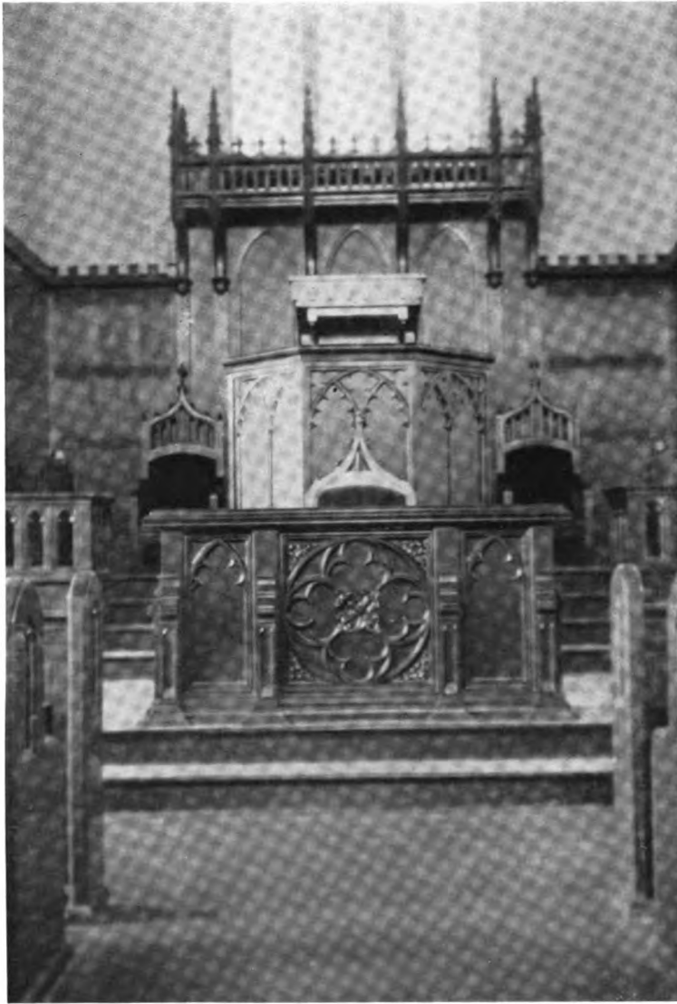
The Walter W. Moore Pulpit in the Church of the Pilgrims, Washington, D. C.