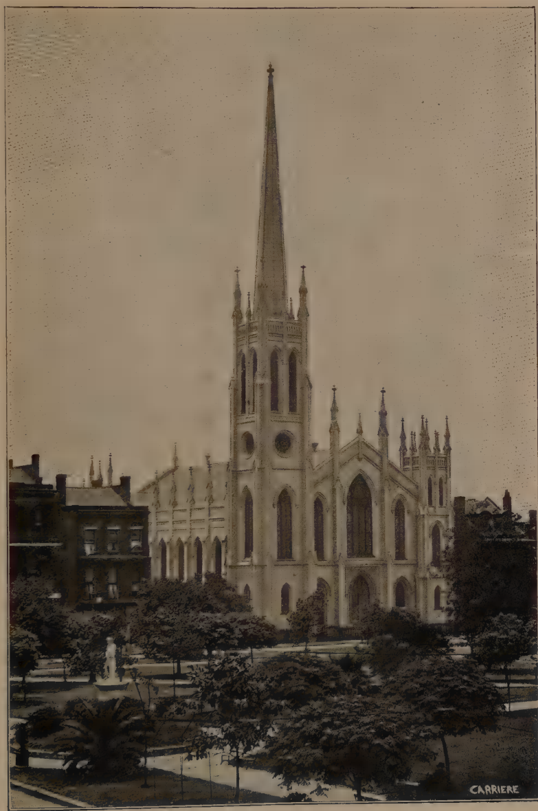
FIRST PRESBYTERIAN CHURCH, NEW ORLEANS, LA.