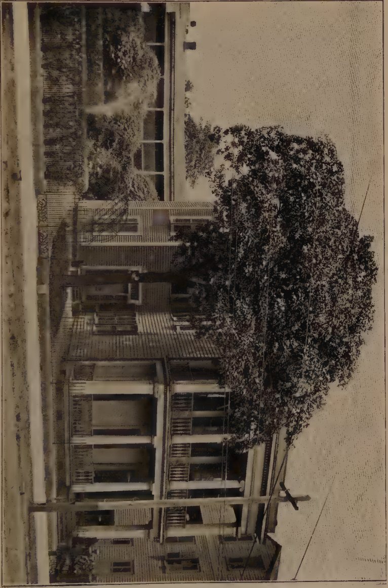
THE PRYTANIA STREET MANSE (1859-1891).