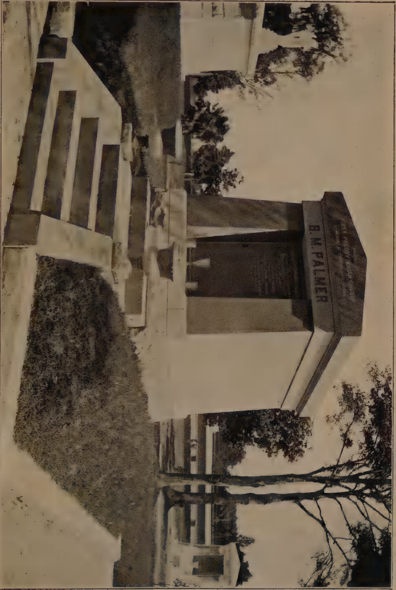
HIS TOMB IN METARIE CEMETERY.