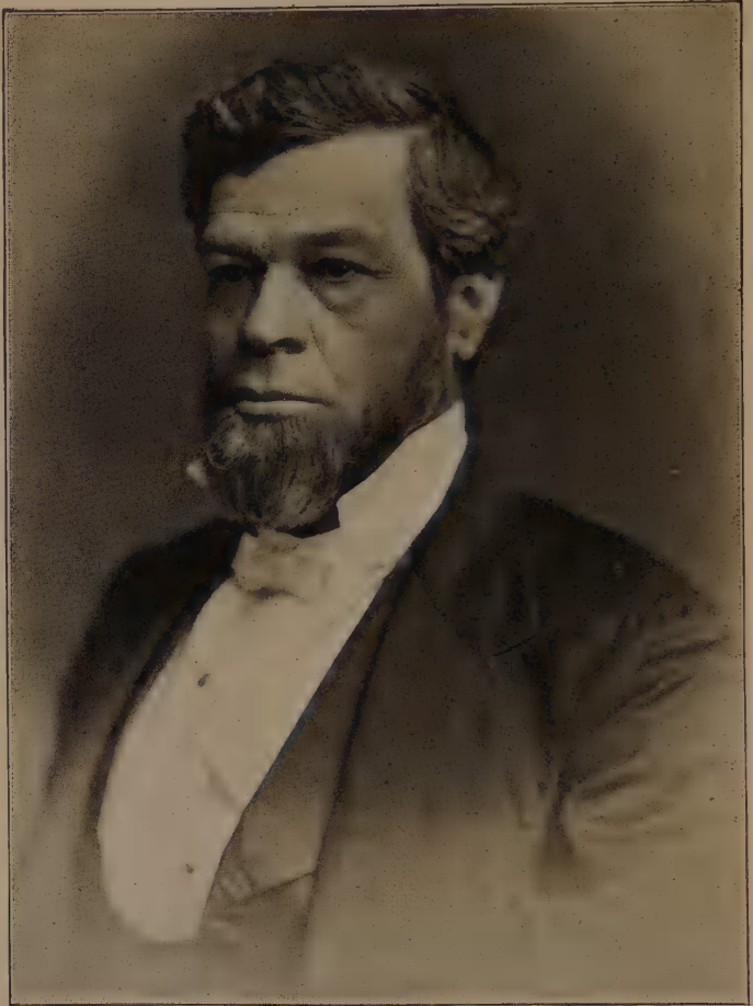
TAKEN ABOUT 1875.