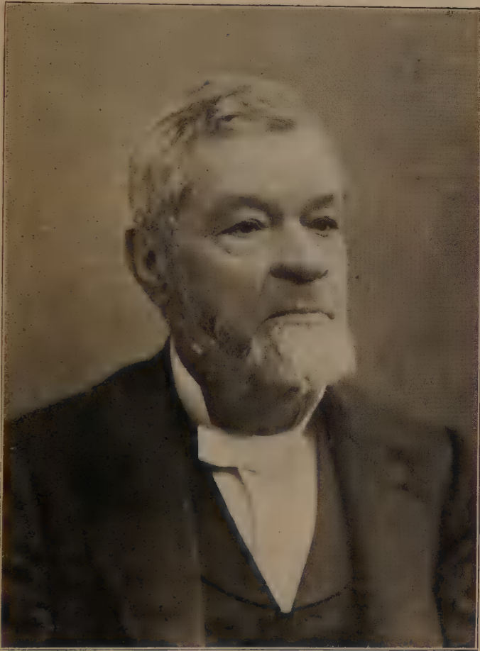
TAKEN ON HIS 80TH BIRTHDAY.