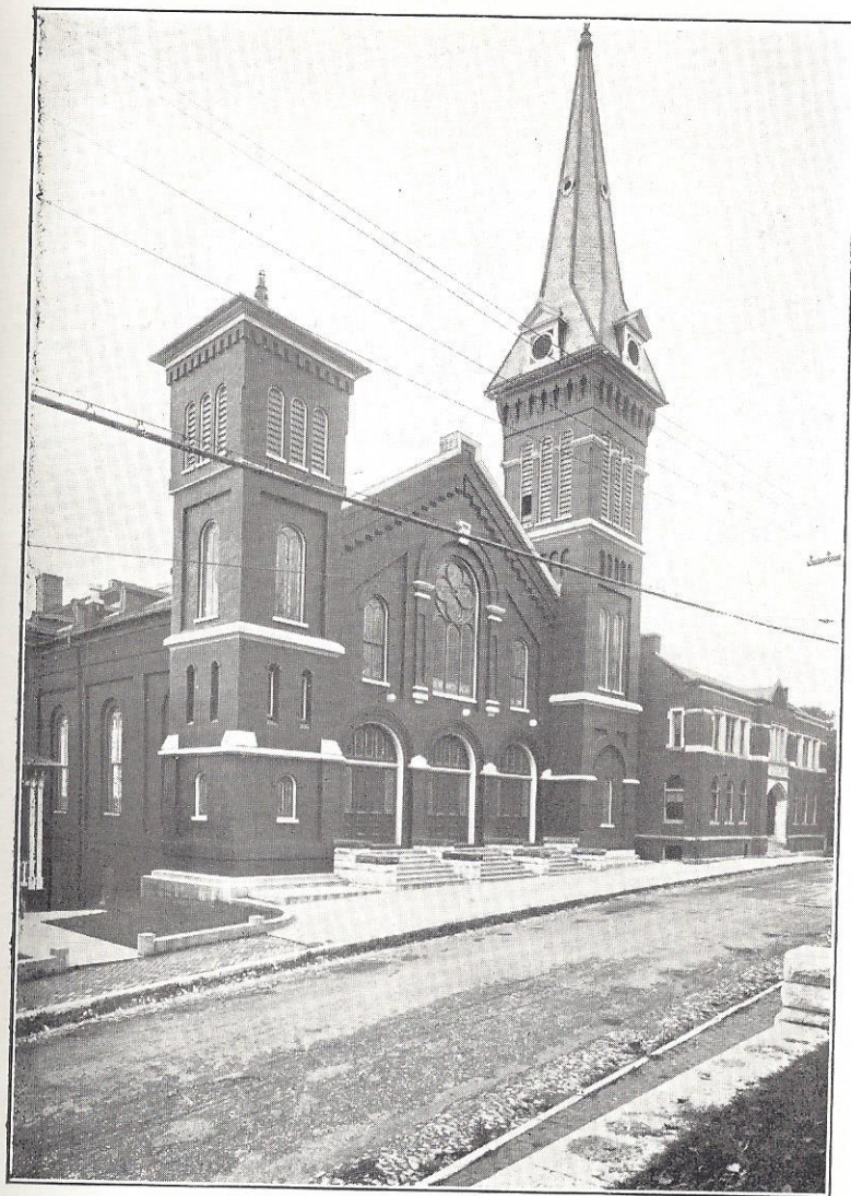
FIRST PRESBYTERIAN CHURCH, STAUNTON, VIRGINIA