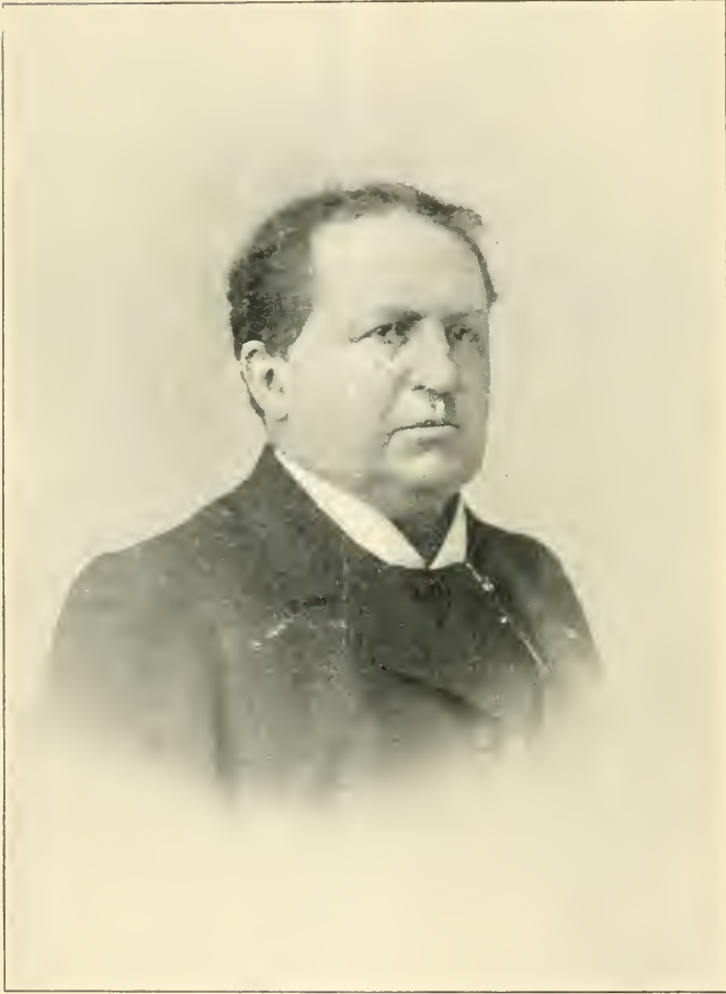
DR. ABRAHAM KUYPER.