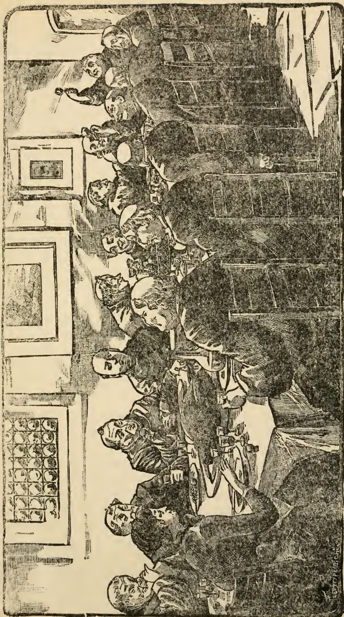
GRAND DINNER OF THE PRIESTS.