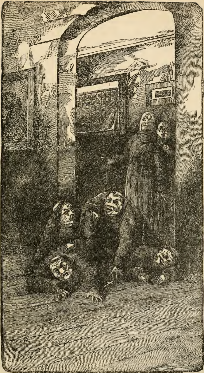
FALL OF THE "HOLY FATHERS."