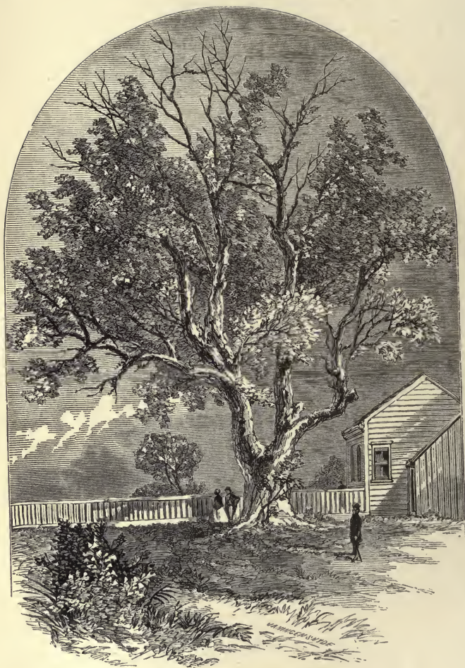
"The Indian Apple Tree at Kannaameek, now Brainerd, N. Y."—P. 75.