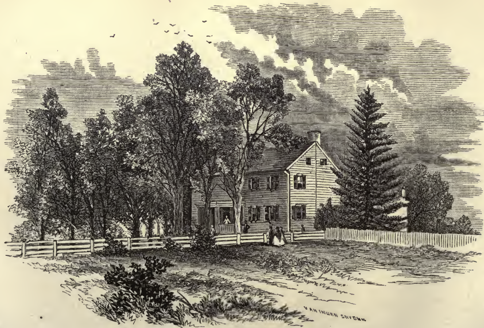
"The Old Parsonage, Cranberry, N. J., near the Indian Town of Bethel."—P. 419.