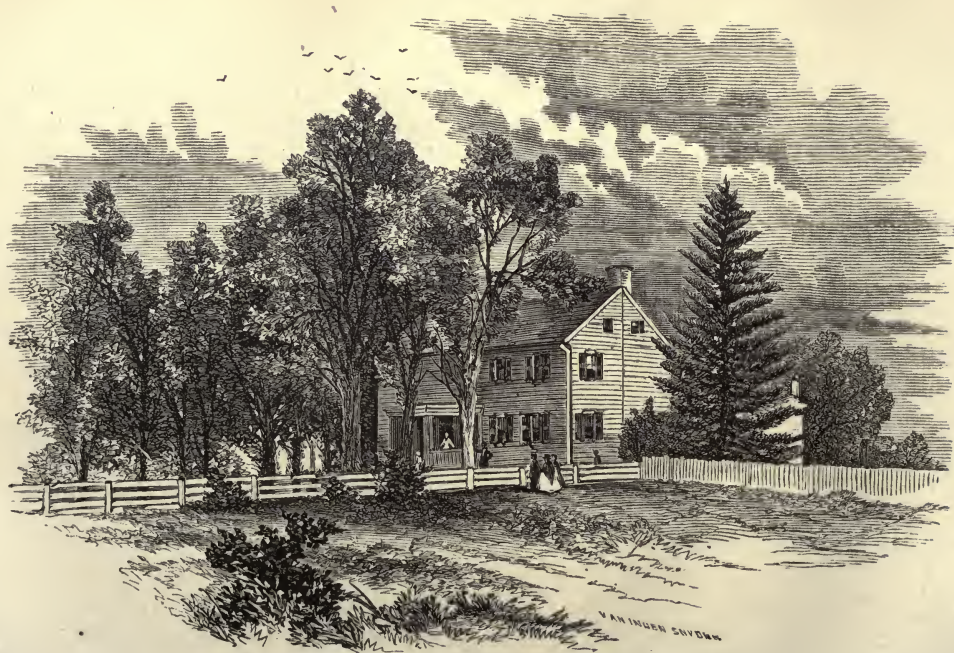
"The Old Parsonage, Cranberry, N. J., near the Indian Town of Bethel."—P. 419.