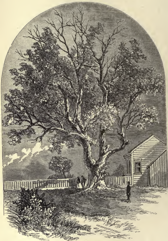
"The Indian Apple Tree at Kannaumeek, now Brainerd, N. Y."—P. 75.