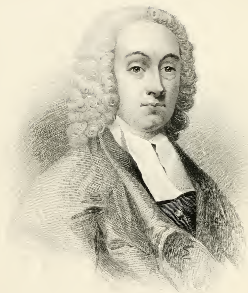
PHILIP DODDRIDGE, D.D.