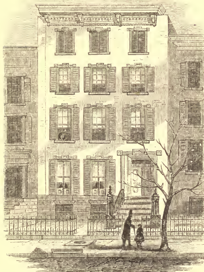
RESIDENCE ON BROOKLYN HEIGHTS.

IN 1856-7 Dr. Beecher removed to Brooklyn, L. I., where, after a few months' residence with his son Henry Ward, he removed to his own house on Willow Street, an engraving of which appears in the vignette. From the first he became a constant attendant on divine worship at Plymouth Church, both on the Lord's Day, and at all prayer and con-