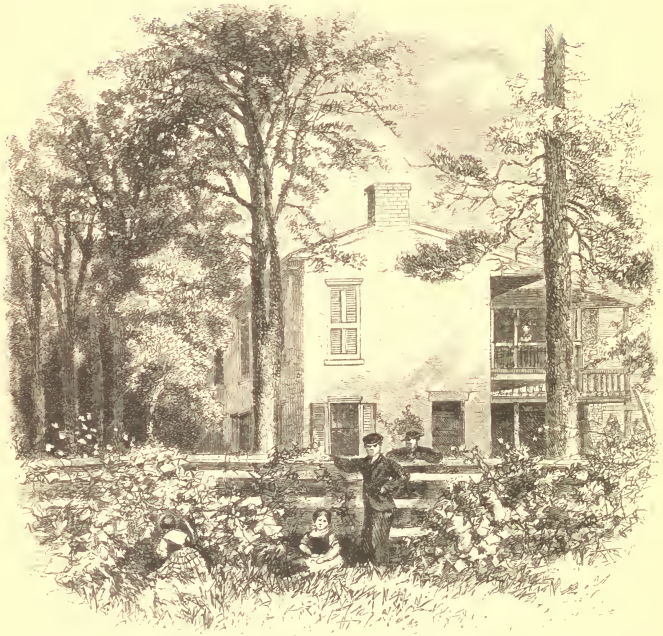
RESIDENCE ON WALNUT HILLS.

DR. BEECHER'S residence on Walnut Hills was in many respects peculiarly pleasant. It was a two-story brick edifice of moderate dimensions, fronting the west, with a long L running back into the primeval forest, or grove, as it was