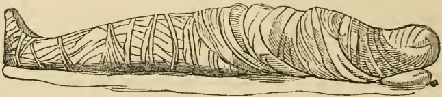
THE MODE OF ENFOLDING THE DEAD IN GRAVE-CLOTHES.

than is common or desirable where coffins are used. In this method the body is stretched out, and the arms laid straight by the sides, after which the whole body, from head to foot, is wrapt round tightly, in many folds of linen or cotton cloth. Or, to be more precise, a great length of cloth is taken, and rolled around the body until the whole is enveloped and every part is covered with several folds of the cloth. The ends are then sewed, to keep the whole firm and compact; or else a narrow bandage is wound over the whole, forming, ultimately, the exterior surface. The body, when thus enfolded and swathed, retains the profile of the human form; but, as in the Egyptian mummies, the legs are not folded separately, but together; and the arms also are not distinguished, but confined to the sides in the general envelope. Hence it is clearly impossible for a person thus treated to move his arms or legs, if restored to existence.