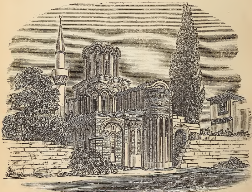
EARLY CHRISTIAN CHURCH AT THESSALONICA.