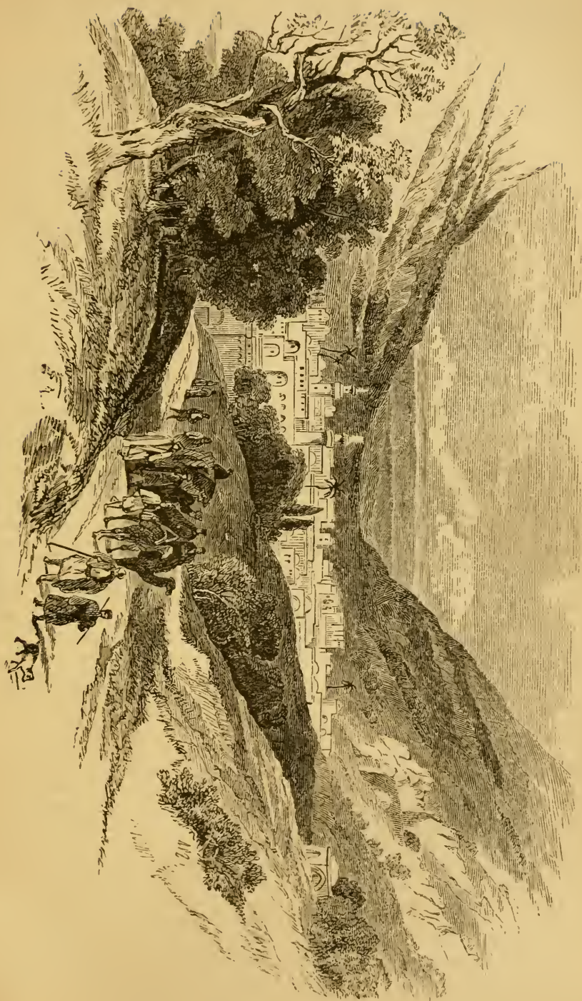
ENTRANCE TO NABIÛS.