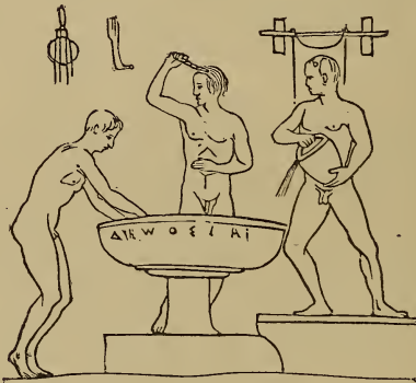
THE GREEK BATH.—From Sir. Wm. Hamilton's vases. in Smith's Dictionary of Greek and Roman Antiquities; article " Balneæ ."

ment, which were embodied in sprinkled baptism, would ignore that ordinance, and silently substitute in its place the rite of immersion; thus bringing to naught and repudiating the products of the divine discipline so assiduously pursued through all those centuries, and dissolving every tie of association between the gospel of Christ and the hopes and expectations which the saints had been taught to cherish, by the unanimous testimony of the law, the prophets, and the Psalms, all speaking in the language of the repudiated rite? (2.) Since the name of baptism , was, beyond question the designation used for the Levitical sprinklings, how else can we understand John, Christ, and the apostles, than as meaning the same thing, in the similar use which they make of the same word?