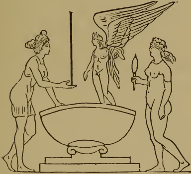
THE GREEK BATH.—The god, Eros, presides. From Sir. Wm. Hamilton's vases, in Smith's Dictionary of Greek and Roman Antiquities; article " Balneæ ."

Such are some of the considerations that present themselves, as, at this point in our inquiry, we view the two diverse rites which assume the name of Christian baptism. Their claims are now to be judged, by a comparison of the New Testament evidence, with what has been already concentrated from the law, the prophets, and the Psalms;—writings all of them equally authoritative and divine.